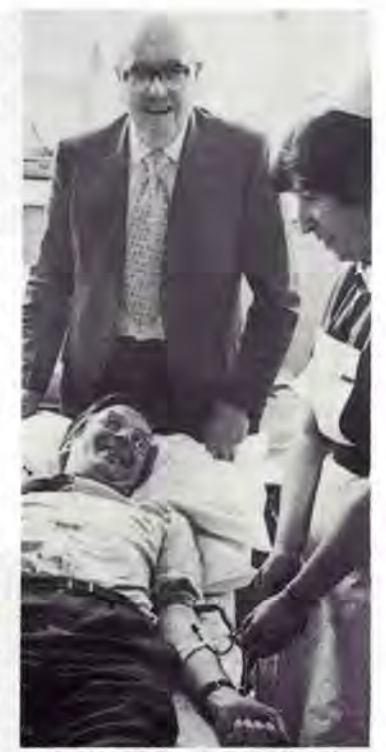
Smiles all round at the Blood Bank.

Luxury two and three bedroom bungalows in the Great Yarmouth area and Norfolk Broads. All-electric, TV, fitted carpets throughout. All sites are well appointed and there are several bungalows to let for most weeks. Just ring Mr. D. J. Baker, 01-529 0020 or write to 131 Old Church Road, Chingford, London E4 6RD, for further details.