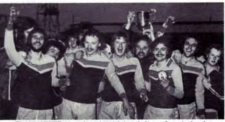
The MANWEB team show their jubilant feelings after winning the Chester F.A. Challenge Cup.

The Chester F.A. Challenge Cup was returned to the Head Office trophy display case after our footballers won it for the second successive year.